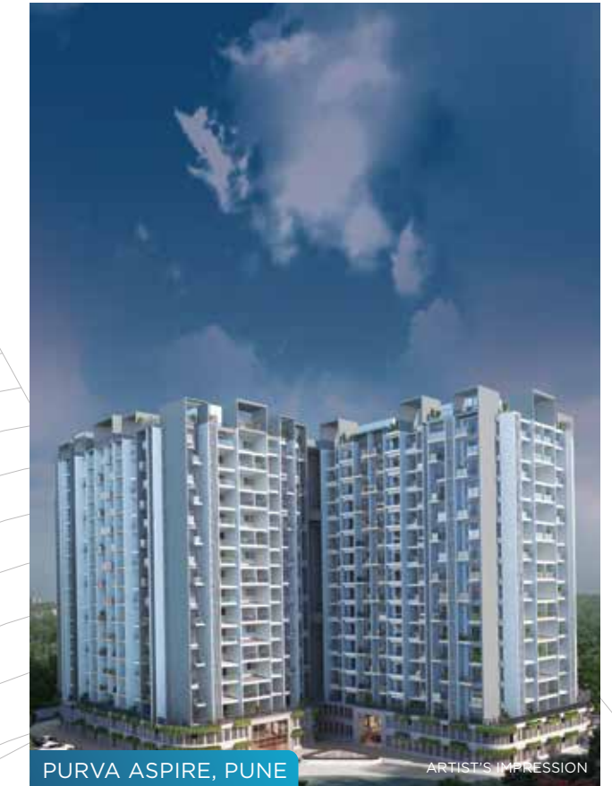
PURVA ASPIRE, PUNE ARTIST'S IMPRESSION