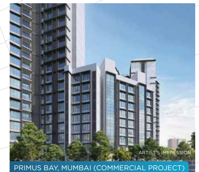
PRIMUS BAY, MUMBAI (COMMERCIAL PROJECT) ARTIST'S IMPRESSION