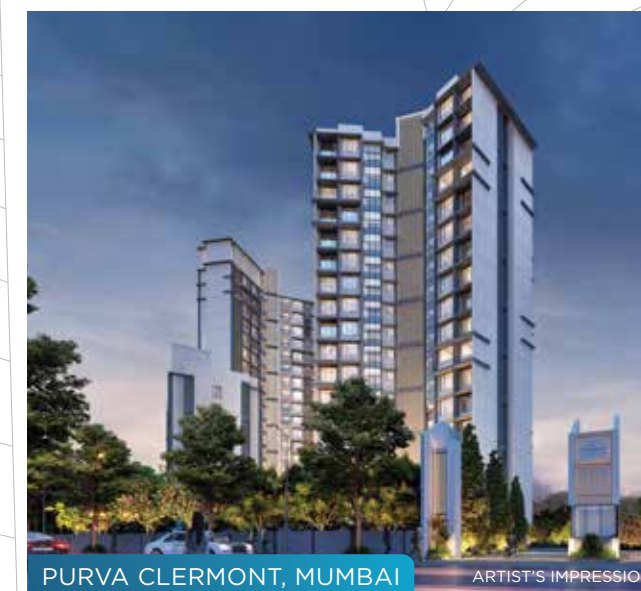
PURVA CLERMONT, MUMBAI ARTIST'S IMPRESSION