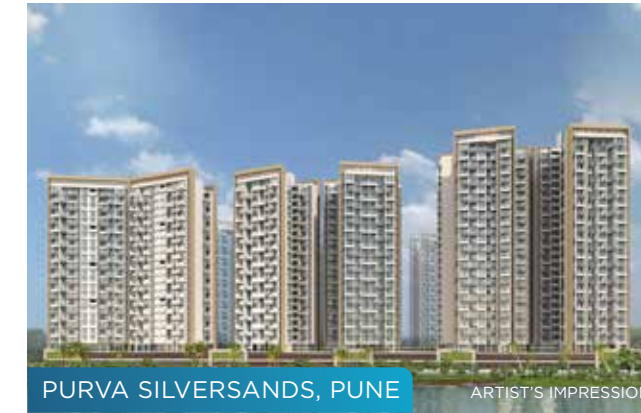
PURVA SILVERSANDS, PUNE ARTIST'S IMPRESSION