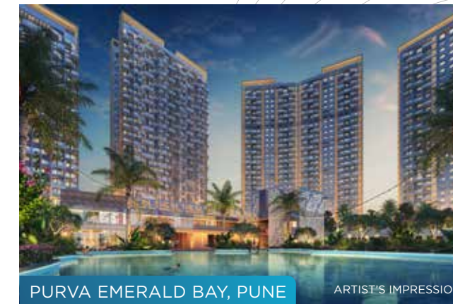
PURVA EMERALD BAY, PUNE ARTIST'S IMPRESSION